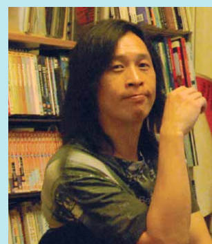
Dr Herman YAU Lai-To 邱禮濤博士