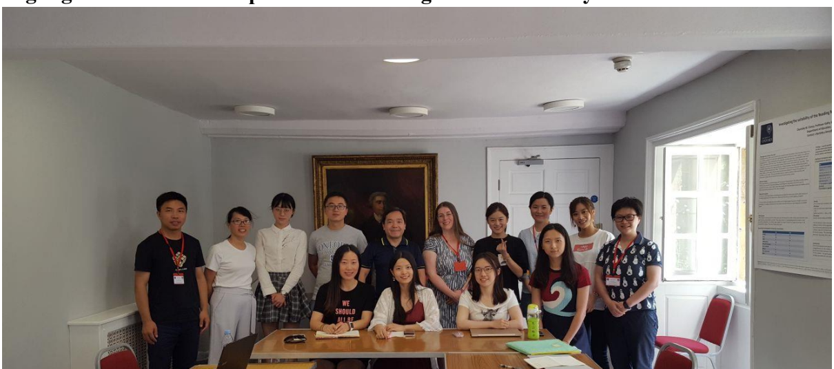
The IPSS 2018 provides the opportunity for students to establish their own research clusters with sharing interests and learning from world-renowned scholars to enrich their research experiences.