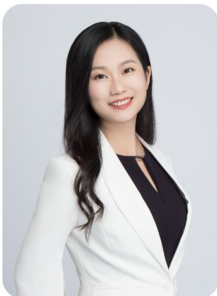
Lawyer, AllBright Law Offices, Shenzhen, China