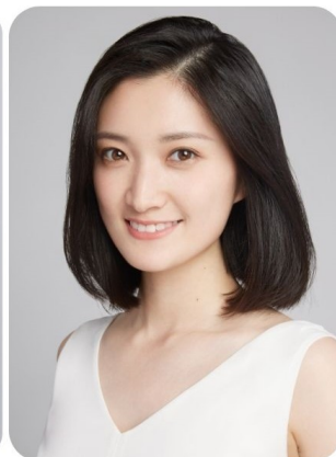
Joined EY Qingdao, now vice secretary of a talent think tank in Shenzhen