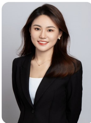
Senior, Assurance, EY, Hong Kong, China